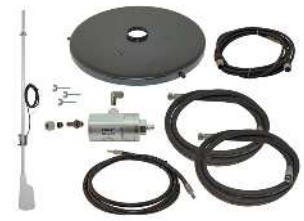
Lid set LG