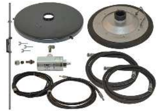
Lid set STA