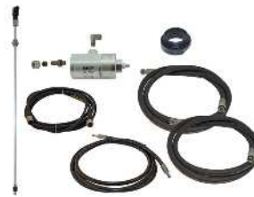
Lid set OS