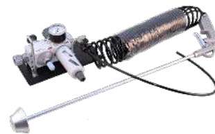
Air regulator unit