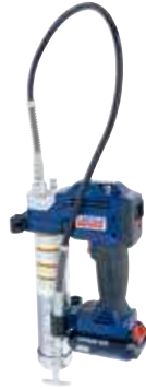
20 V Li Ion PowerLuber Model 1882

Lincoln's PowerLuber family includes a full range of battery-operated grease guns, including NiCad and Lithium-ion-powered tools, as well as pneumatic and electric options. Developed by the lubrication experts, the PowerLuber line has the right grease gun for your needs.