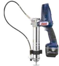
18 V NiCad PowerLuber Model 1842