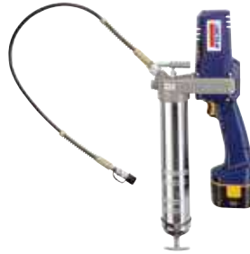
12 V PowerLuber Model 1242