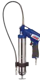
Pneumatic PowerLuber Model 1162