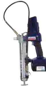
18 V Li Ion PowerLuber Model 1862