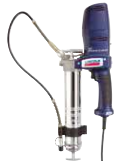
120 V AC PowerLuber Model AC2440